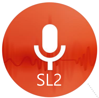
Major: Artificial Intelligence (AI) include Voice Recognition