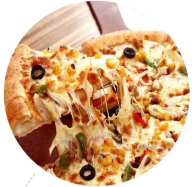
7 years experience of Ordering pizza!!!