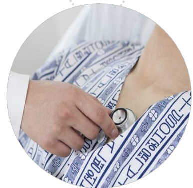
Hospitalized for a week