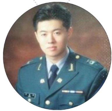
Military Service (3 years)